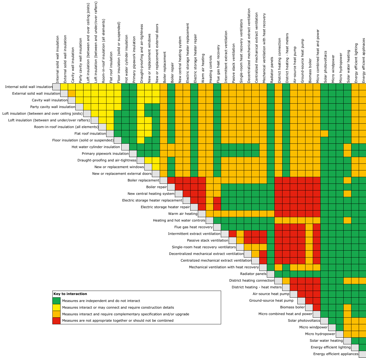
Figure D.1 – The measures interaction matrix